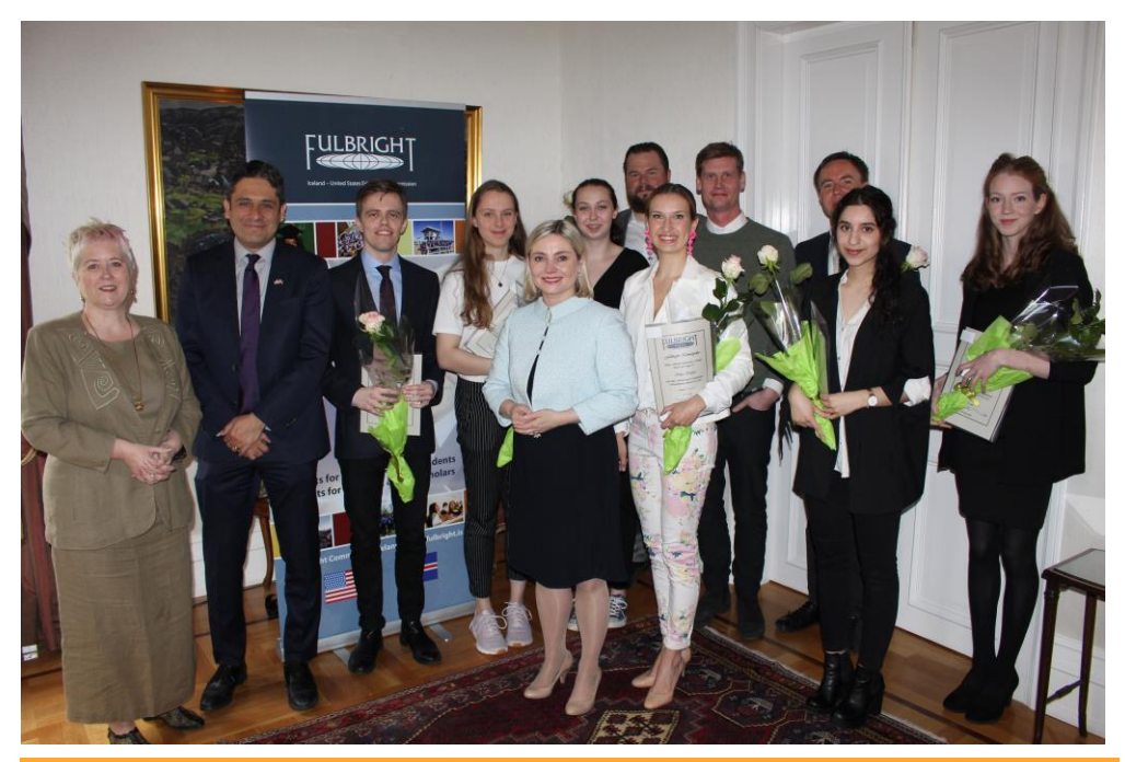
ICELANDIC GRANTEES WITH THE MINISTER OF EDUCATION, SCIENCE & CULTURE, THE CHAIRMAN OF THE FULBRIGHT BOARD AND THE ED OF THE FULBRIGHT COMMISSION