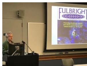
The ED gave a talk at Columbia University on Fulbright opportunities