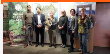
ED visit to the Agricultural University

The Commission works to ensure that all universities in Iceland are aware of Fulbright opportunities and to create a level playing field. To this end the ED visits all universities in the fall and gives presentations both for students and faculty, where she discusses Fulbright opportunities as well as study in the US in general. These visits over the past years have resulted in a marked increase in cooperation with universities outside of Reykjavik, especially the hosting of US scholars, who play an important role in strengthening Iceland's small academic community and assisting with internationalization efforts. US scholars also benefit from more diverse opportunities to be hosted in Iceland.