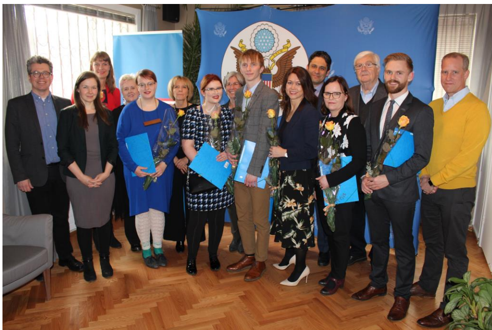
ICELANDIC GRANTEES WITH FULBRIGHT BOARD MEMBERS AT THE US EMBASSY